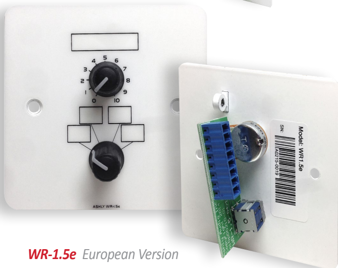
WR-1.5e European Version