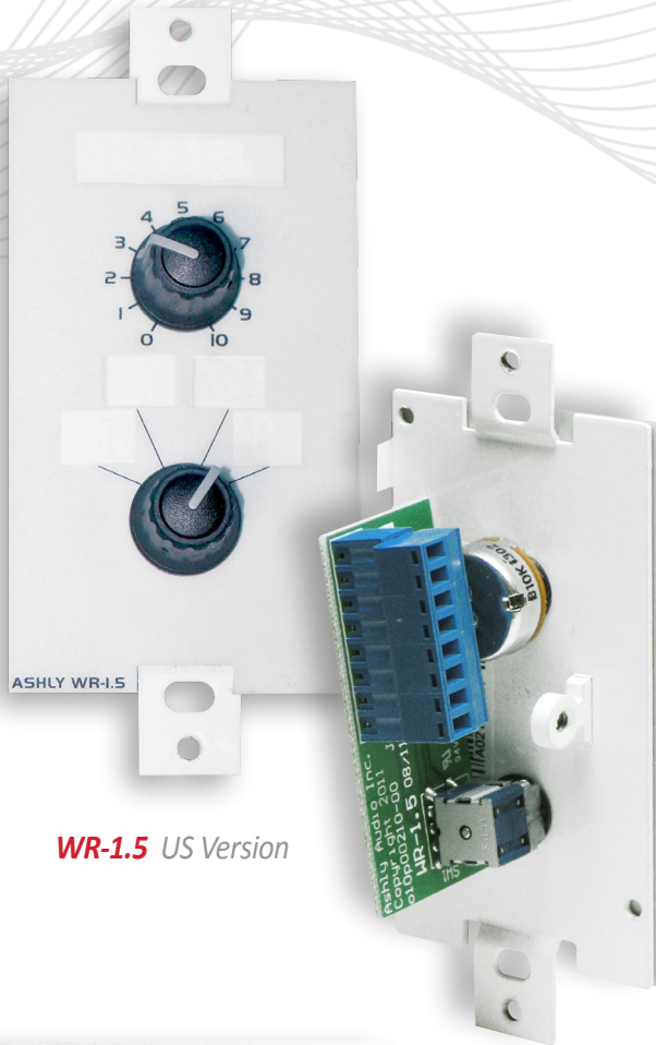
WR-1.5 US Version